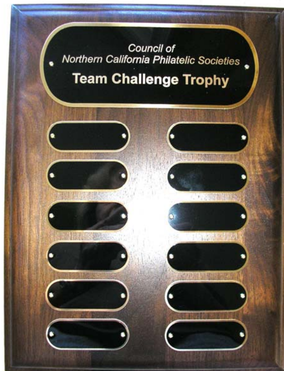
The Team Challenge Trophy

Each participant received a special ribbon, and the winning team members received a special First Place ribbon. As soon as we can get the plaque engraved, a special perpetual trophy will be presented to the winning team's club engraved with the date and names of the winning team members.