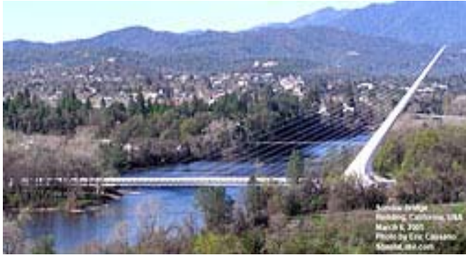
A Scenic View of Redding