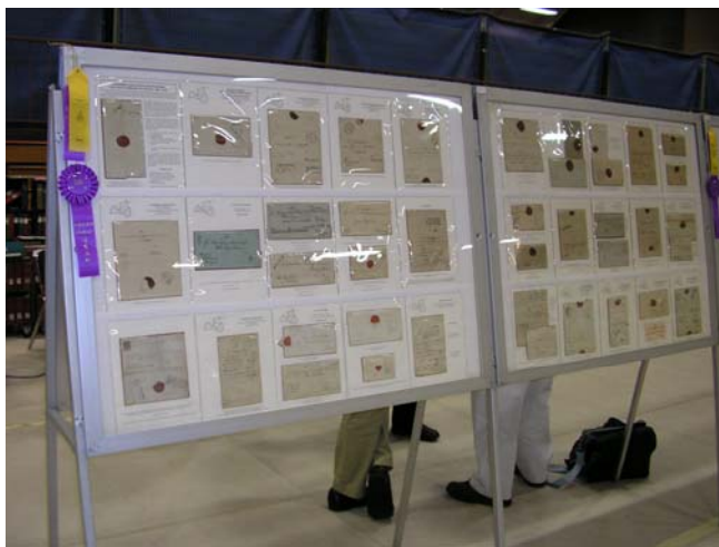
"Feet Behind the Frames"

The judges worked hard "behind the scenes" to decide the results.