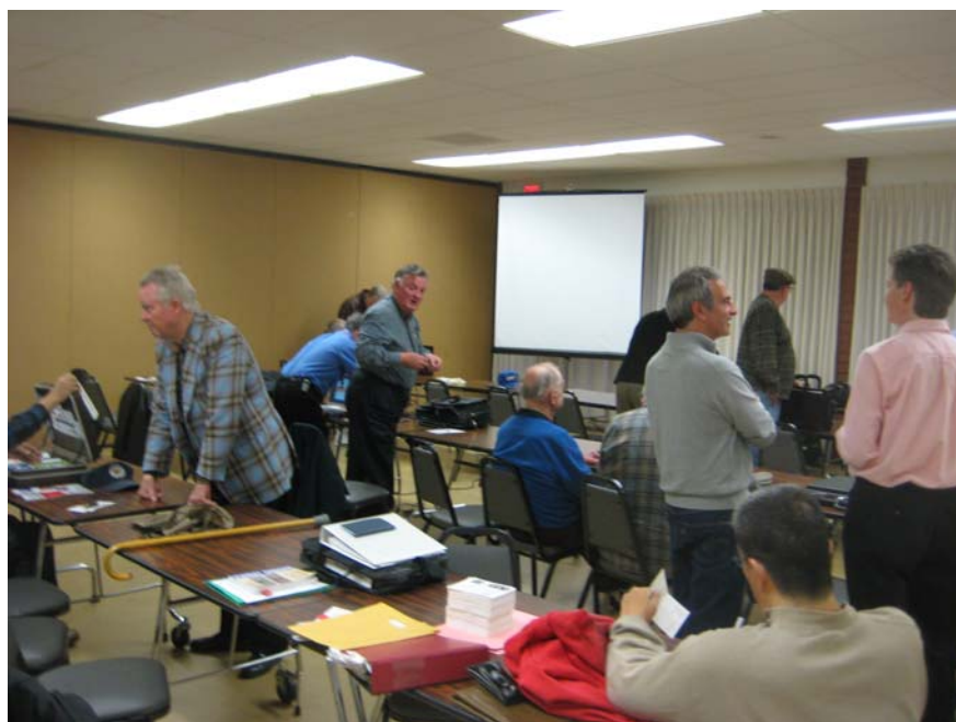
Club Members Get Ready for the Tour