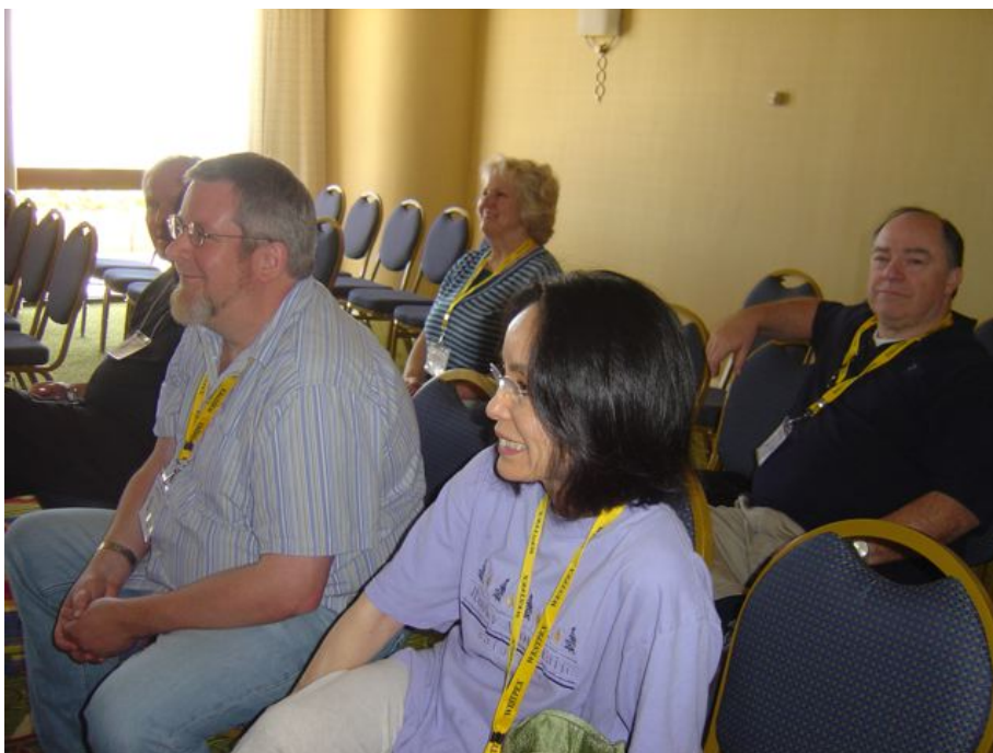
The Audience Listens with Rapt Interest