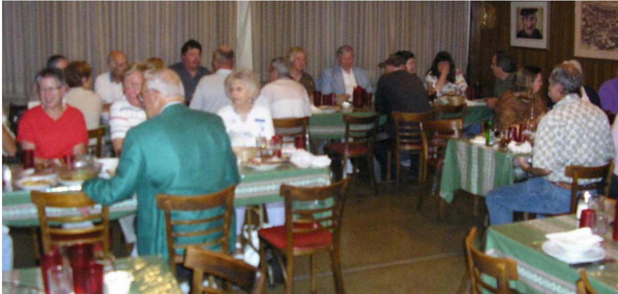
The Show Banquet

Here are some photos from the Greater Reno Show.