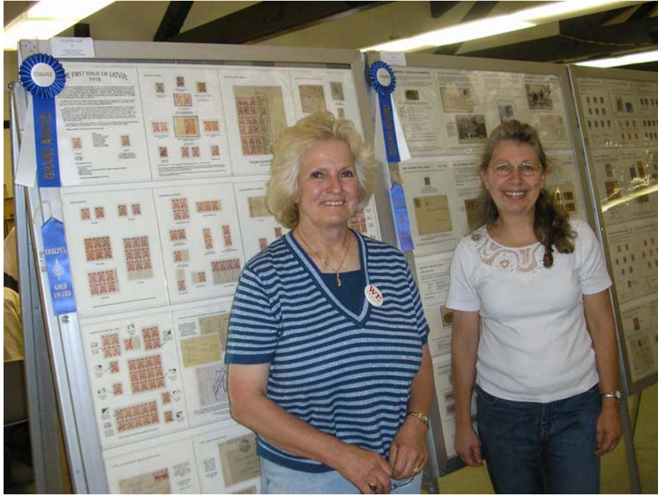
Gold Award Winners

This year's COALPEX show was dedicated to woman stamp collectors. All exhibits were by female collectors. Here are the Palmares awards and some photos from COALPEX 2008.