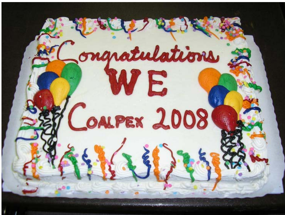
Congratulations Cake for the Woman Exhibitors at COALPEX