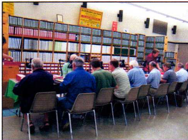
A&D Packs 'Em In