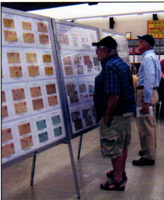
Top &amp; Bottom: Enjoying the EBCC Exhibits