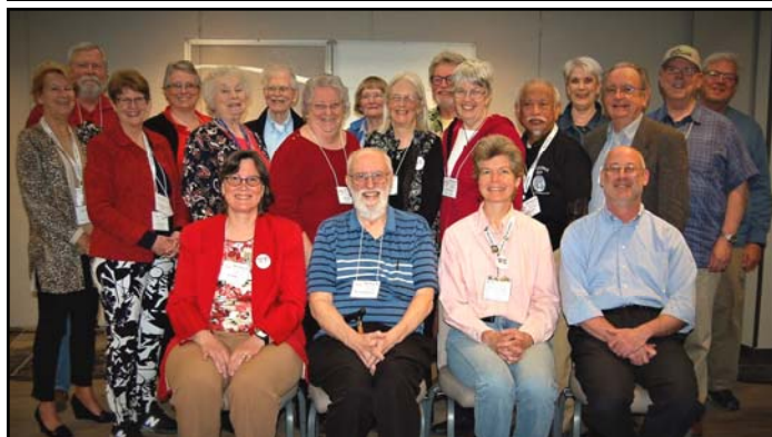
Participants in WE FEST VI. A few are missing from this photo due to WESTPEX Committee obligations.