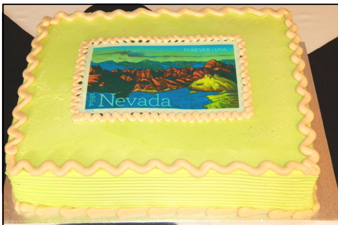
The Awards Banquet cake with the image of the 2014 Nevada Statehood stamp

The stamp show was just a part of “Reno is Artown” and also part of the official Nevada Sesquicentennial Celebration. Special commemorative tokens were struck at the Carson City Mint and made up part of the awards given out for the show.